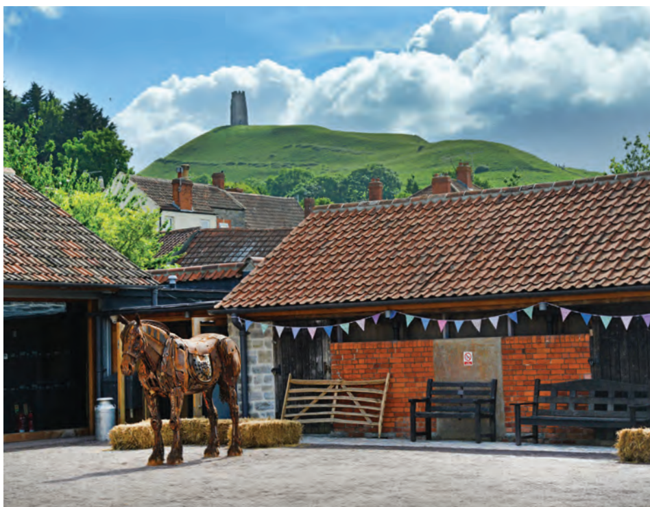
SOMERSET RURAL LIFE MUSEUM, GLASTONBURY