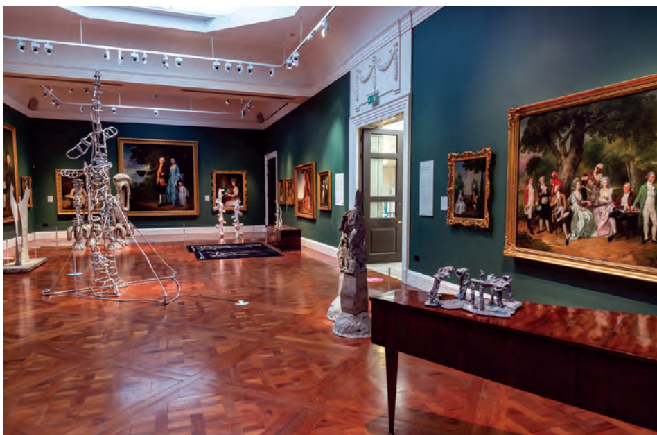
HOLBURN MUSEUM, BATH

Supplement front cover: Unknown artist 'Queen Elizabeth I' (circa 1588) © National Portrait Gallery, London