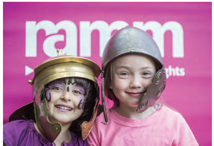
ROYAL ALBERT MEMORIAL MUSEUM & ART GALLERY, EXETER

Monday - Friday 10am - 4pm, Saturday 10am - 4:30pm • Free entry