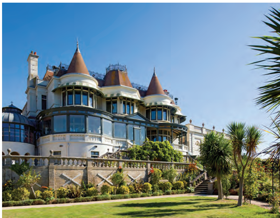
RUSSELL-COTES ART GALLERY & MUSEUM, BOURNEMOUTH

In the Summer 2021 issue of Evolver Magazine I wrote about how museums were coping with the cancellation of exhibitions and the adjustments they were making to deal with the lockdowns caused by the pandemic. As we head into 2022 many museums are coping really well and have adapted with imagination as the goalposts constantly move.