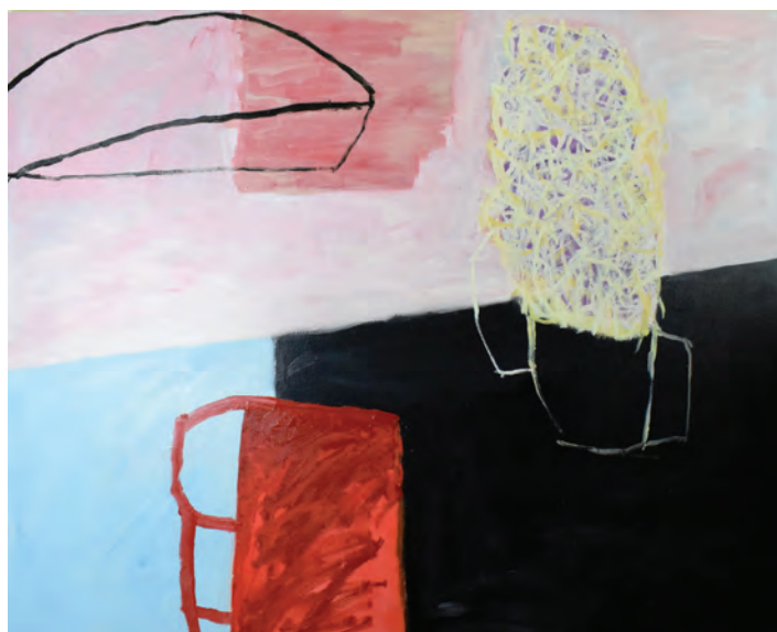
MICHELLE GRIFFITHS 'RECIPE FOR DISASTER'