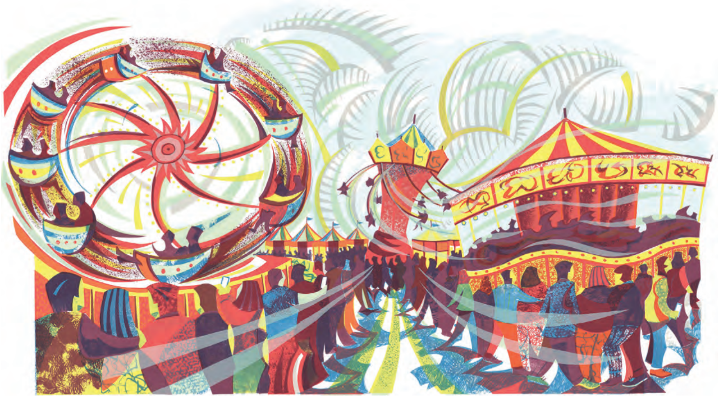
PAUL CLEDEN 'CLOUDS OF CANDYFLOSS' (Sculpture by the Lakes + Dorset County Hospital)

spectacular seasonal show in their multi studio site opposite the vintage railway station.