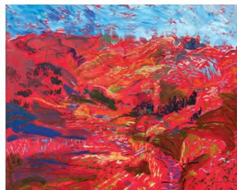
PHIL CLAYTON (Sou'-Sou'-West Gallery)

As the nights draw in and mornings find our landscapes shrouded in mist and dripping with dew, it is clear that winter is almost upon us. The beauty of our surroundings are still enticing but it is easy to stay close to home and snug and warm. The WESSEX WINTER GUIDE is designed to give you a seasonal tour around the region, focussing on what our artists and makers have on offer at this time of year.