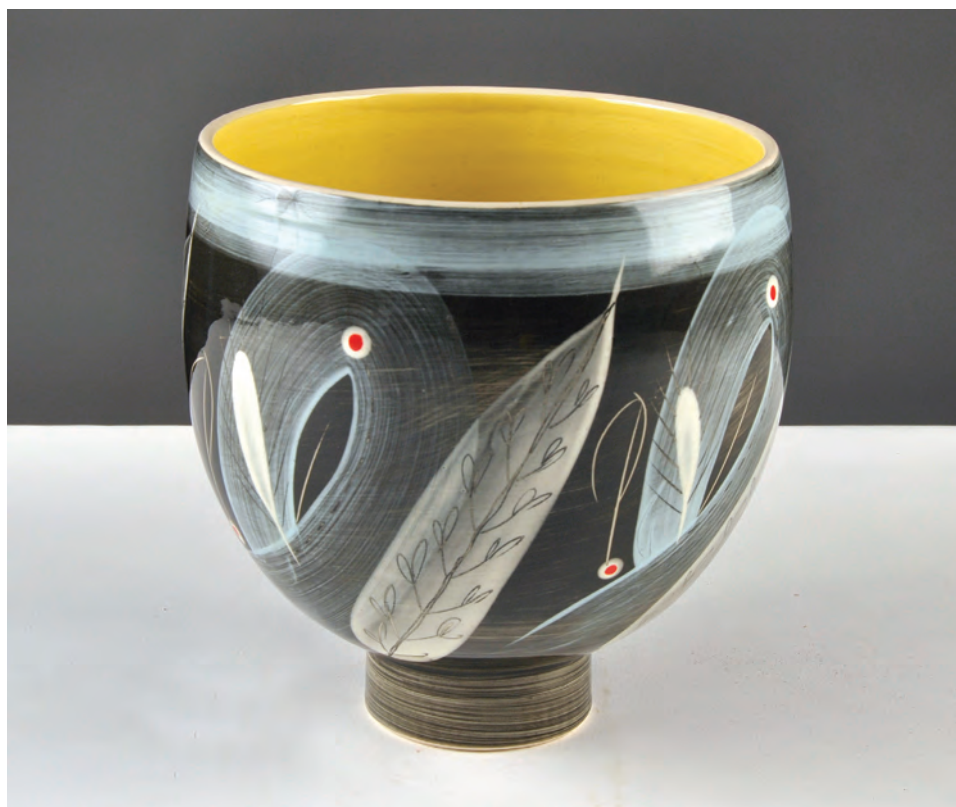
RAMP (Thelma Hulbert Gallery)